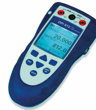
DPI 812 Handheld RTD Loop Calibrator