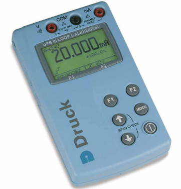
UPS-III Rugged and Extremely Compact Loop Calibrator

⚠ Safe and Hazardous area versions available