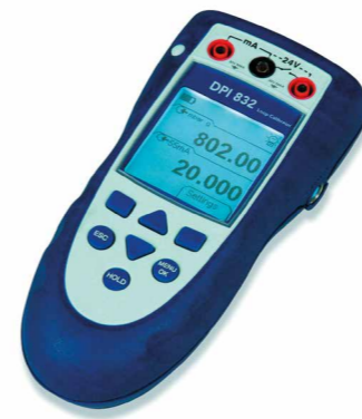
DPI 832 Handheld Electrical Loop Calibrator