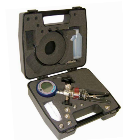
PV Hand Pump & DPI 104 Indicator Packages