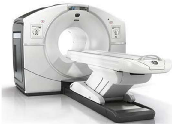
Figure 1: CT Scanner