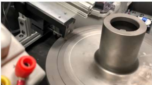
Figure 3: Closeup view of EC probe riding on surface of target disk