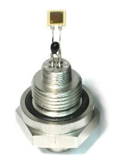
Figure 1: Aluminum oxide sensor with temperature sensor on a process mount with Viton O-ring % \left( {{{\rm{T}}_{{\rm{T}}}}_{{\rm{T}}}} \right)

Factory calibration of these sensors is better described as characterization. The sensor is exposed to varying levels of water vapor, with nitrogen or air as the carrier gas. At each moisture content, the raw signal (capacitance, impedance, etc.) is recorded. This table of moisture content with its corresponding signal is programmed into the analyzer or transmitter. The typical recalibration cycle is once a year.