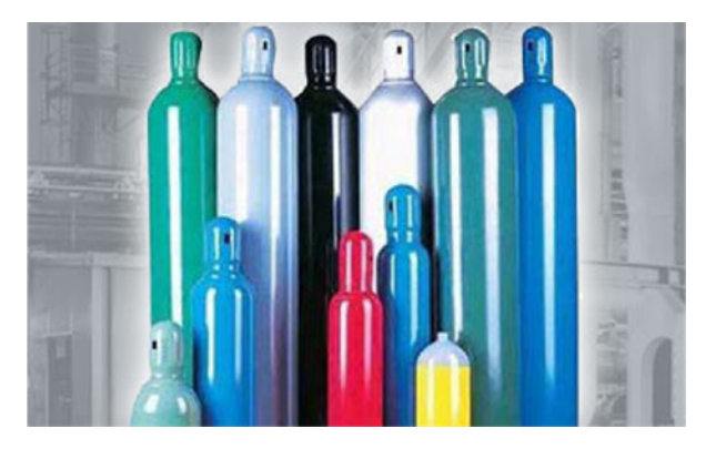
Figure 3: Gas cylinders

Instrument technicians are very familiar with the use of calibration cylinders. These are used extensively to calibrate other analyzers such as oxygen analyzers. There are several manufacturers of calibration cylinders for water vapor. Typically, these are provided with nitrogen as a background gas. Although available down to 1 ppmv, practically, 10 ppmv has been the lower limit.