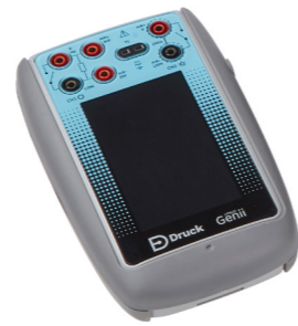
DPI 620 Genii Multifunction Calibrator

The Elite range gives you state-of-the-art calibration, communication and data integration on the move. Featuring temperature, electrical, frequency and pressure calibration with HART, Foundation Fieldbus and Profibus communications, the Elite range gives you fast, intelligent workflows on the move. Modular design gives you the capability of a full calibration lab, anywhere in the field. And if you need dedicated test and calibration devices, our Essential and Expert ranges have you covered.