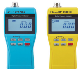
DPI 705E Pressure Indicator

The day-to-day test and calibration tools you can rely on. Druck's Essential product range is tough, reliable, accurate and easy to use. So you can get on with your job and trust our Essential range to do theirs. And if you need higher accuracy, or wider functionality, our Expert and Elite ranges have you covered.