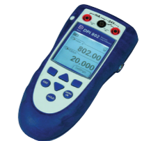
DPI 802 Pressure Indicator with mA