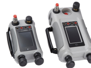
DPI611 & DPI612 Handheld pressure calibrators