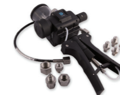
PV411A Multifunction Hand Pump*