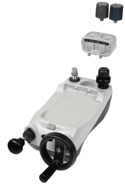
DPI620 GENii Modular calibration system