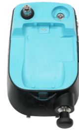
PV624 Hybrid pressure controller