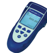
DPI 800 Pressure Indicator: Higher Accuracy