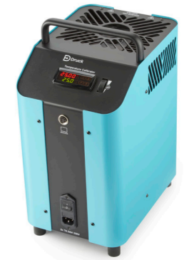
Temperature Calibrators Dry Block and Multifunction options