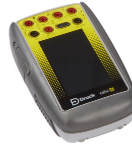
DPI 620 Genii-IS Multifunction Calibrator