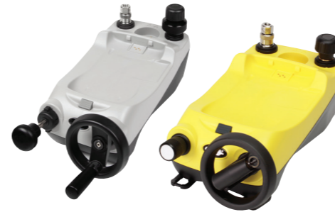
Hydraulic and Pneumatic Pressure generation bases