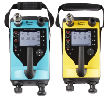
DPI610E Series Pressure Calibrator

Our high performance Expert range provides incredible calibration capability built around Druck's benchmark reliability, accuracy and ease-of-use. This high accuracy range gives you leading mobile calibration for electrical, temperature and pressure applications. And if you need wider test and calibration solutions, our Essential and Elite ranges have you covered.