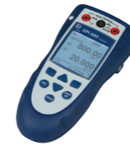
DPI 880 Multifunction Calibrator