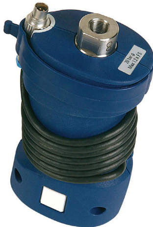
External IDOS universal pressure module

*Provides absolute pressure option in addition to gauge pressure. In absolute mode adds barometric pressure to gauge pressure range. For absolute mode ranges below 1 bar please consult your sales representative.