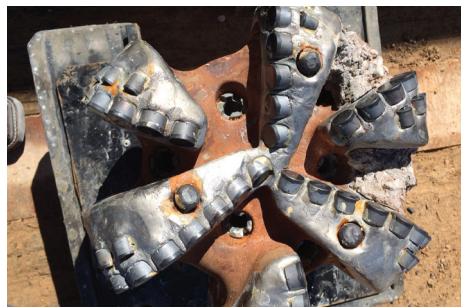
The TerrAdapt bit showed a very good dull condition after the run because its adaptive elements mitigated stick-slip and absorbed impacts to protect the cutters.

The TerrAdapt bit completed the 3,355-ft (1023-m) section in one run, increasing ROP by 27% compared to ROP on offset wells drilled with standard PDC bits. ROP averaged 168 ft/hr and the surface torque generated by the TerrAdapt bit was 45% lower on average and 90% more consistent. This translated to more efficient drilling, with up to a 45% improvement in mechanical specific energy recorded. These results indicated dramatically reduced stick-slip and torsional oscillations, and the section was completed with no damage to the BHA.